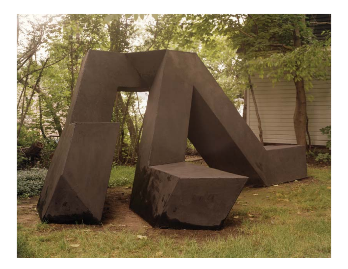
Figure 2. Tony Smith. Willy. South Orange, NJ. 1962 (constructed).

a work of art. On the other hand, it did something for me that art had never done. At first I didn't know what it was, but its effect was to liberate me from many of the views I had had about art. It seemed that there had been a reality there which had not had any expression in art.<sup>3</sup>