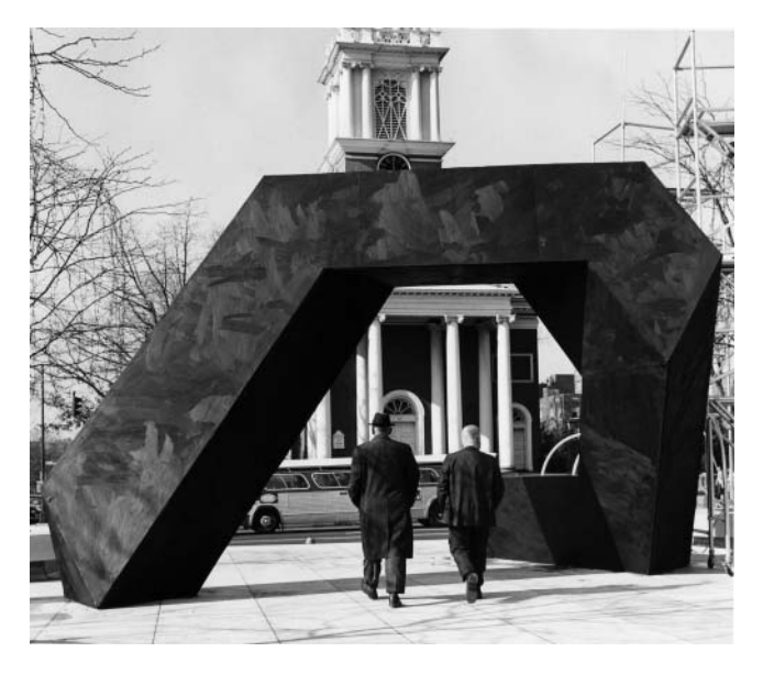
Figure 3. Tony Smith. Cigarette . Tower Square, Hartford, CT. 1966. Photograph: Edward Saxon. © 2017 Tony Smith Estate / Artists Rights Society (ARS), New York.

these works were conceived to stimulate physical engagement and alter the experience of public space. The 15-ft tall, 26-ft wide Cigarette was placed in Tower Square (Figure 3). Composed of four tetrahedral prisms, Cigarette formed a sprawling arch through which people could walk. The arch was installed to frame the rotunda entrance to the Beaux-Arts Travelers Tower and the neoclassical portico of Hartford's Center Church.