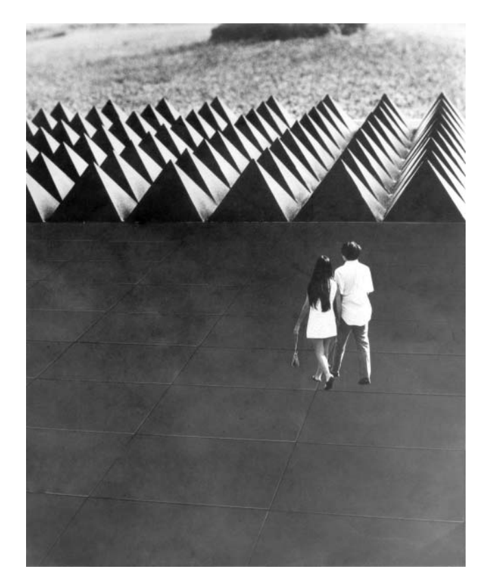
Figure 6. Tony Smith. Photomontage with Hubris. 1970.

was an open space, while the other was populated by 81 abutting tetrahedrons. The two square grids constituted distinct spatial experiences. The former was intended to be accessible and traversable, while the latter was crowded and imposing. Smith experienced the work as essentially hostile and was surprised to learn that students played among the pyramids.<sup>56</sup> Smith also conceived Haole Crater for the University of Hawaii, which, while also never realized, bears a direct relationship to Project for a Parking Lot. Haole Crater was to have two pedestrian levels: a sunken square, accessible by ladder, and a raised sidewalk surrounding it. Smith described the work as follows: