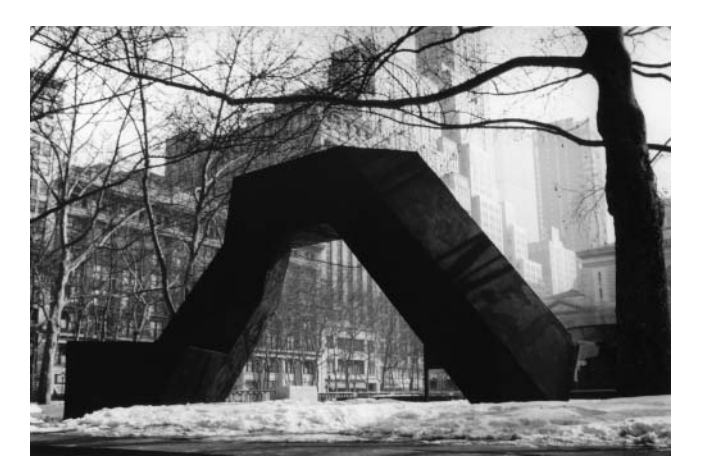
Figure 5. Tony Smith. Cigarette. Bryant Park, New York City. 1967.

Albeit temporary, Smith's exhibition was a challenge to the spatial legacy of Moses. Smith's sculptures constituted an aesthetic negation of the figurative